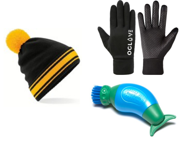
Your Local Stockist in Harborough so save on your postage costs!